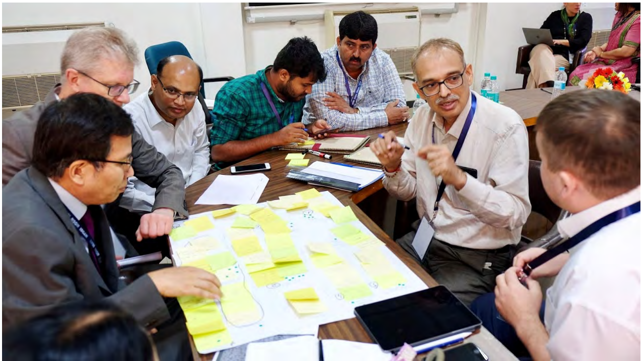
Figure 5. Group activity during the workshop.

To encourage open and honest discussion amongst participants, the workshop did not involve any commercial stakeholders; only government and research actors were present and the conversations were conducted under the Chatham House Rule.