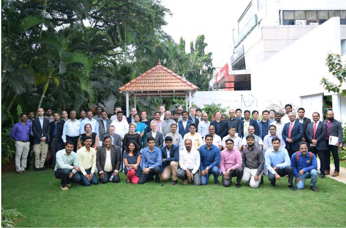
Figure 1. Group photo during site visit at Mysore.

The participants also visited a smart grid control centre and conducted a site visit to a Mysore neighbourhood where smart meters and a distribution transformer monitor have been deployed. They were also given a tutorial on a software system the smart grid control centre is piloting for monitoring and managing the distribution system.