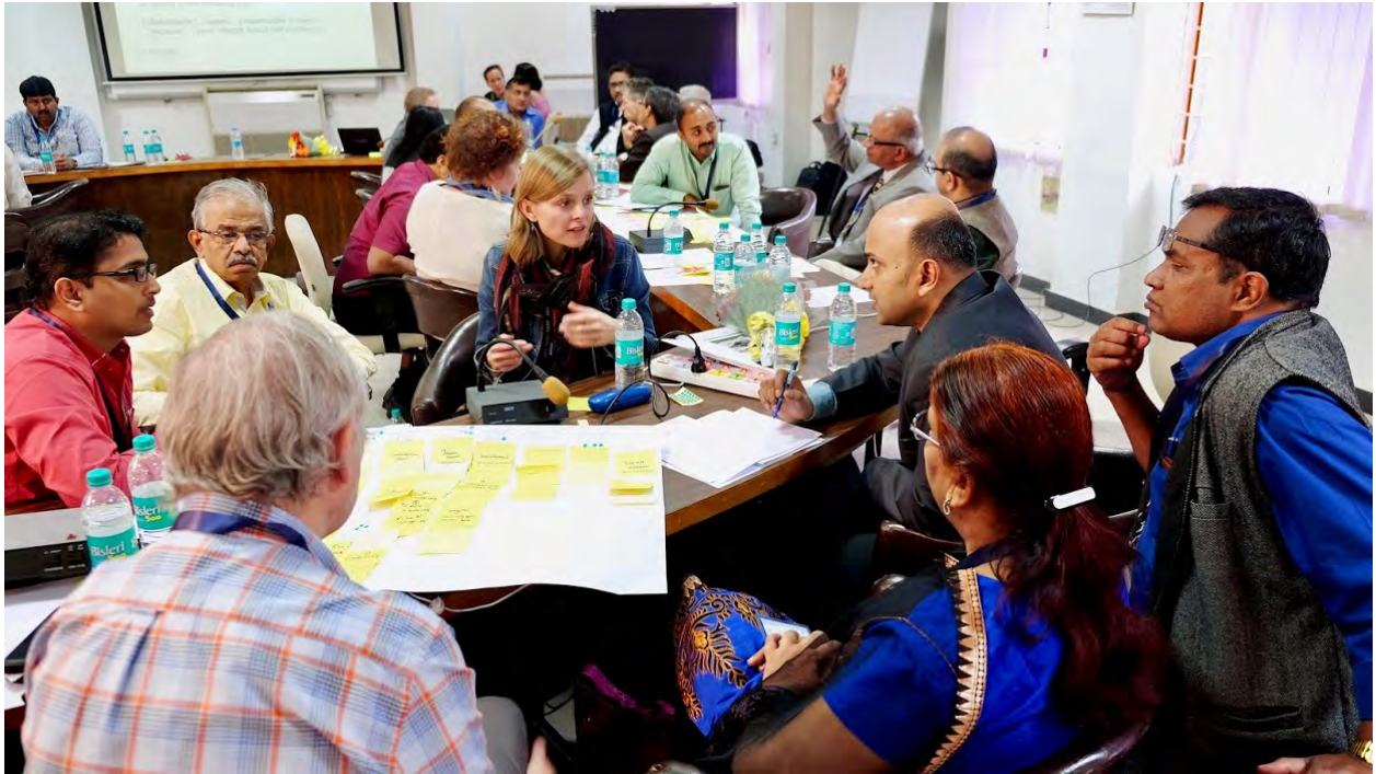
Figure 6. Group work during the workshop.